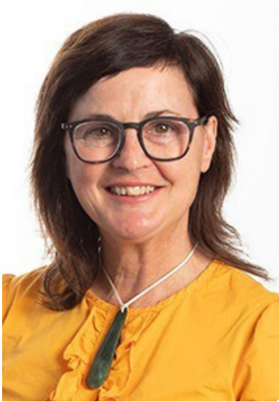
Deputy Mayor Laurie Foon